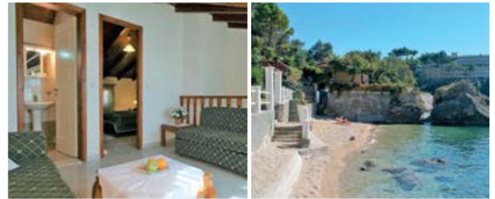
Beach near the cottage