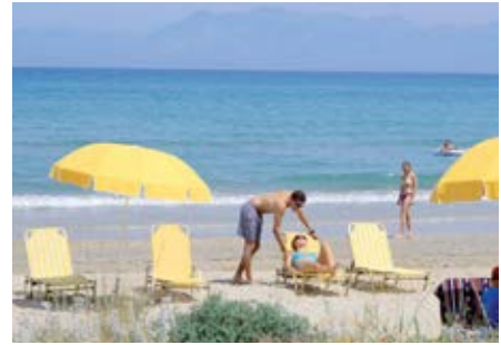
Beach at St George's Bay