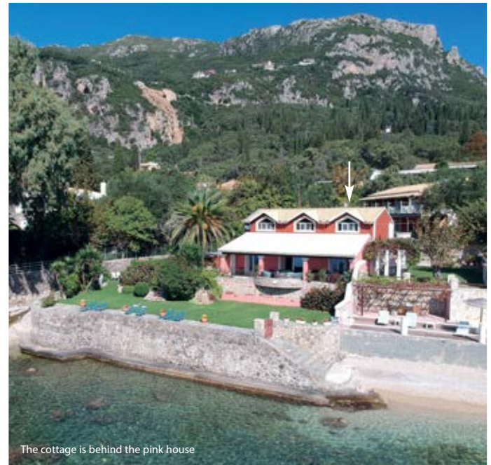
The cottage is behind the pink house

The Cottage: Self Catering Cottage for 2 Air Conditioning Free WiFi 1 day's free boat hire