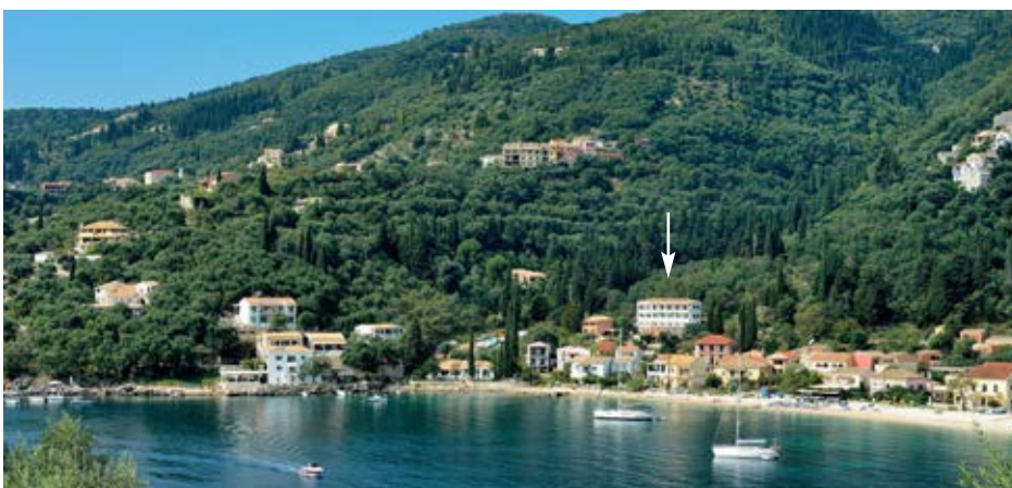
Kalami and location of Kalami Bay

Due to the hillside location and a number of steps in the property we would not recommend Kalami Bay to anyone with mobility difficulties.